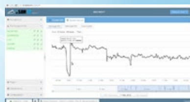
eSAM FT software for on-board data acquisition and processing