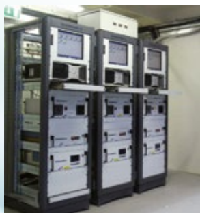
MIR FT rack cabinet