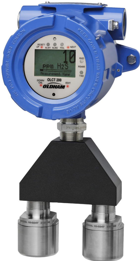
OLCT 200 with dual sensor option

The OLCT 200 universal electronics allow any of the 3-4-wire versions to be equipped with relays, RS-485 Modbus, HART, or isolated 4-20mA outputs. In addition, all 3-4 wire toxic/oxygen, IR, & PID versions come standardly with the Arctic Heater allowing sensor operation down to -45°C/-49°F. With the ability to swap these components in the field it is possible to stock one transmitter type with different modules and sensors and configure the unit as needed for installation in the field. This feature eliminates the need to stock individual gas transmitters and can reduce inventory costs.