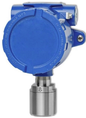
Remote PID, Catalytic Bead, or Infrared Sensor